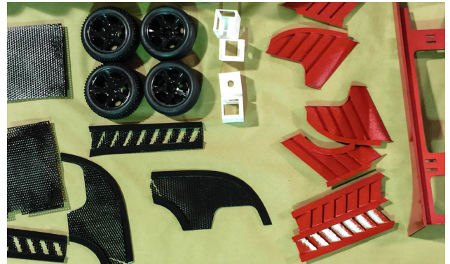
From the earliest concept models to the printed parts included in the final product delivery, the 3D printers have proved to be useful in roles beyond the scope of a "rapid prototyping" tool.